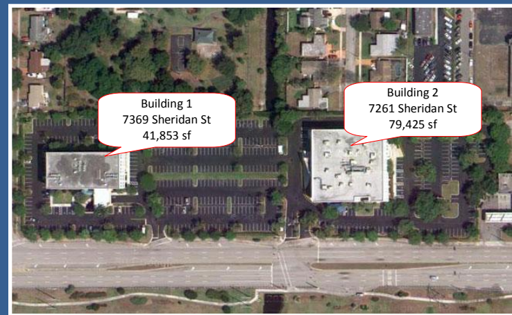
This two building “campus” has abundant parking and is situated at the signalized intersection of Sheridan Street and NW 72nd Avenue.